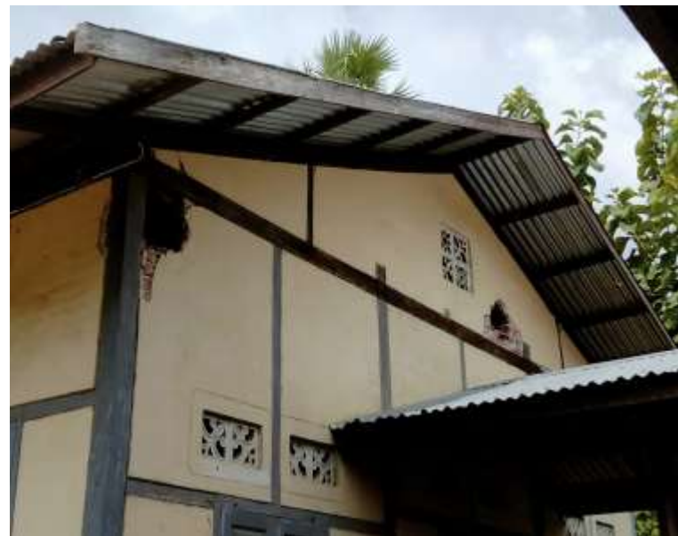
Figure 8: Outside building damage in Let Yet Kone village, showing large gaps allegedly from airstrikes on 16 September 2022 (Source omitted to maintain the safety of the social media user).