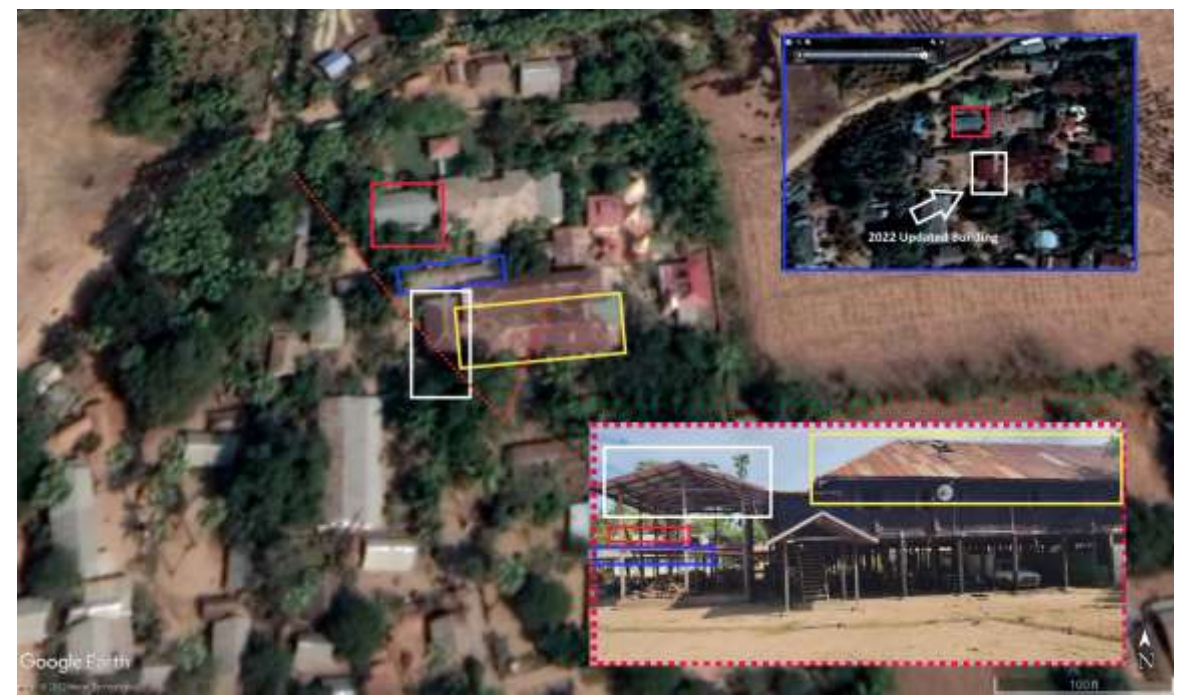
Figure 4: Geolocation of a structure from Figure 3 in Let Yet Kone village (လက်ယက်ကုန်း).