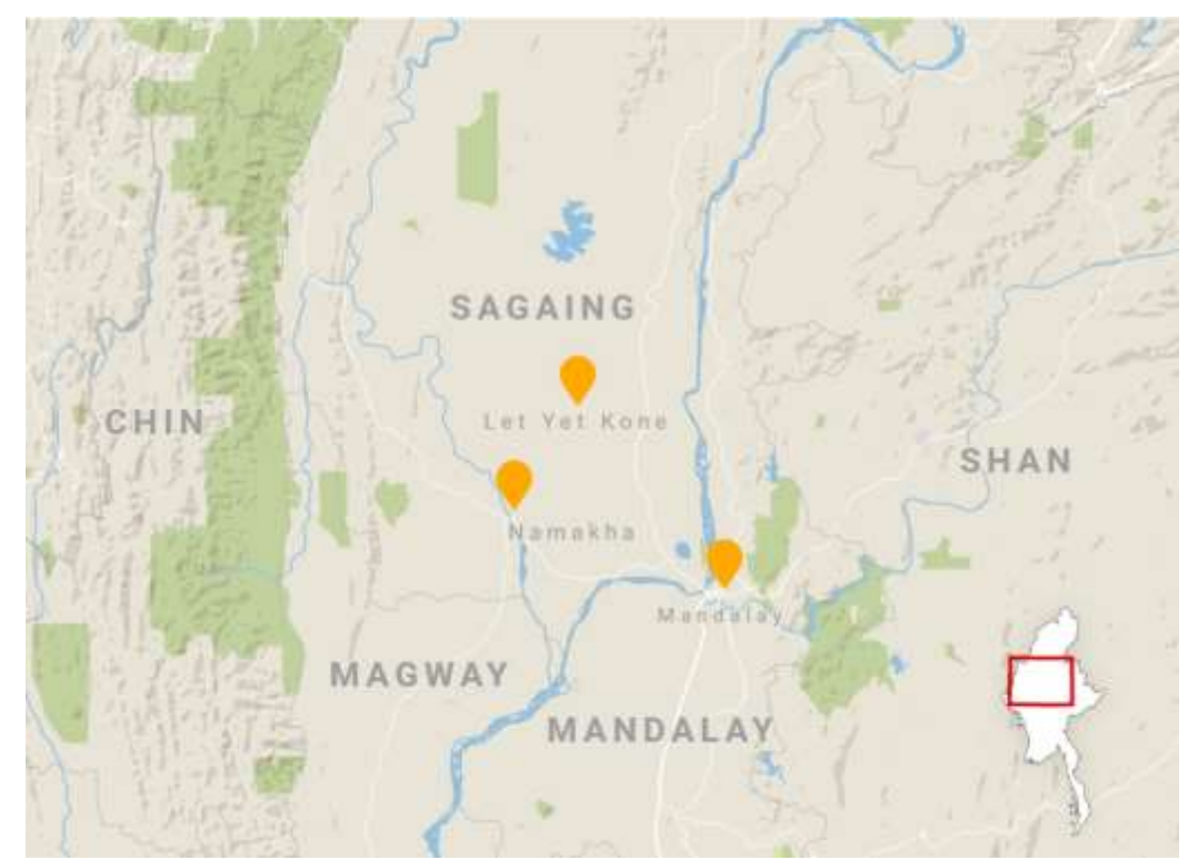
Figure 1: A mapping of Let Yet Kone village (လက်ယက်ကုန်း) and Namakha (နမခ) located in Sagaing Region (စစ်ကိုင်း). (Map created using Datawrapper).