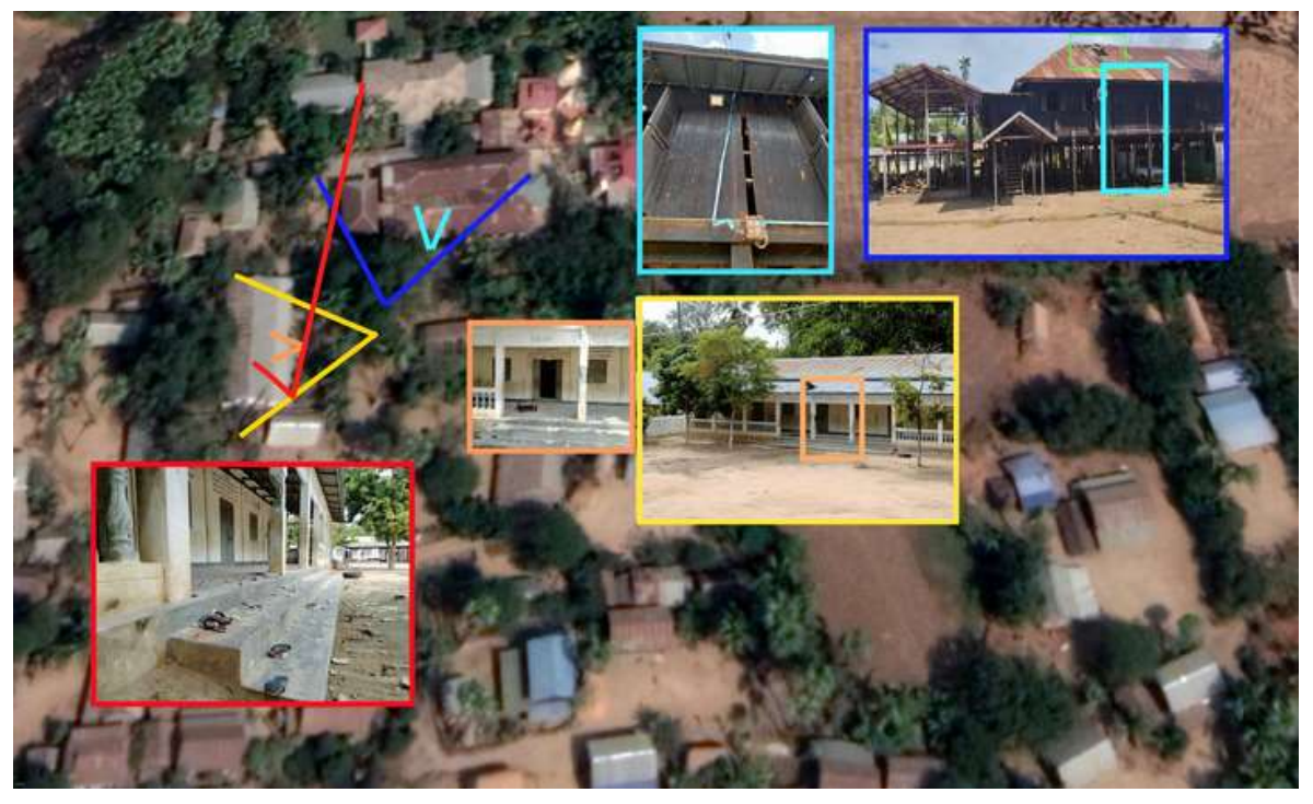
Figure 5: Further Geolocations of structures in Let Yet Kone village.