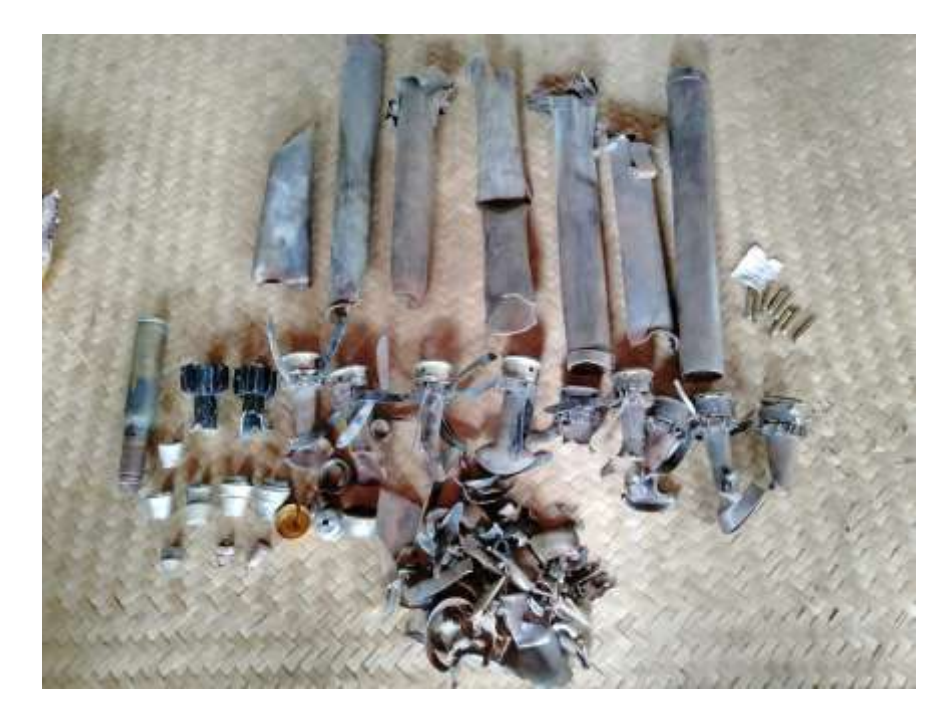
Figure 10: Aftermath of airstrike debris allegedly gathered from the 16 September 2022 airstrike attack in Let Yet Kone village, Sagaing State. Confirmed S-5 rocket remnants are shown. (Source omitted to maintain the safety of the social media user).

It is plausible that the high level of damage seen in the area was caused by a Mi-35 air attack. The attack reportedly lasted nearly one hour. Locals' <u>depiction</u> of events tell of a stark and bloody aftermath, with many people reported injured, some severely, with limbs lost. Debris from shelling and the airstrike left casings, including the verified <u>remnants</u> of claimed S-5 rockets reportedly from the scene, shown in Figure 10. The S-5 rocket can only be fired by compatible fighter helicopters and jets which are used mainly for ground area targets. The SAC's MAF are the only known entity in Myanmar that have aircraft suitable for S-5 rocket use.